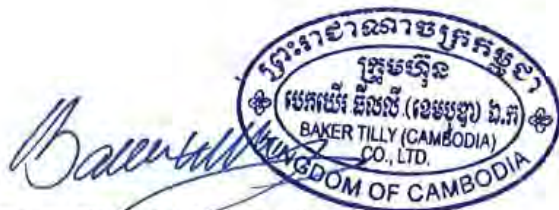
Baker Tilly (Cambodia) Co., Ltd. Certified Public Accountants

The financial statements of PPWSA for the financial year ended 31 December 2020 and the condensed interim financial information of PPWSA for the quarter and three-month period ended 31 March 2020 were audited and reviewed by another firm of certified public accountants whose report dated 24 March 2021 and 28 July 2020 expressed an unmodified opinion and unmodified conclusion, on those financial statements and condensed interim financial information respectively.